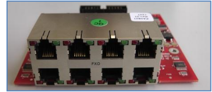
XR0025 Front View

This private exchange 8-port FXO module supports the Xorcom SPI (Serial Peripheral Interface) internal Astribank bus and is designed to operate with PSTN POTS lines. It supports 100% electronic operation (no relays) based on solid-state DAAs (Data Access Arrangements). The module is electrically isolated, with a capacitive coupled line circuit. Built-in surge protection tested per FCC part 68.